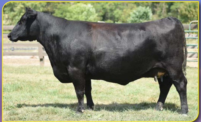
BLUE LAKE BLACKCAP 5119 - Lot 11 This Hoover No Doubt daughter sells with a POSS DEADWOOD heifer calf as lot 11