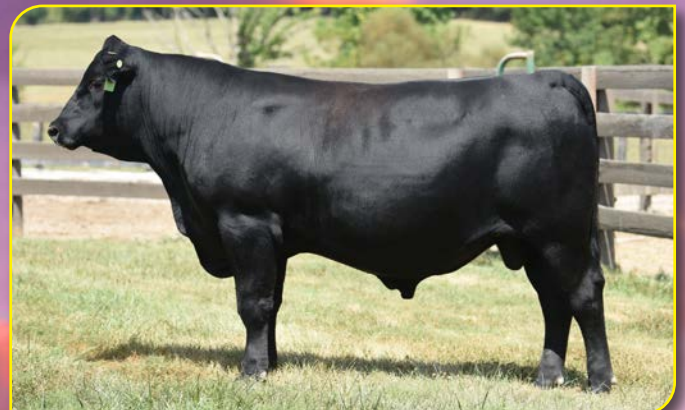
Heritage Surpass 352 - Lot 32

These herd bull prospects sell as lots 31 & 32.