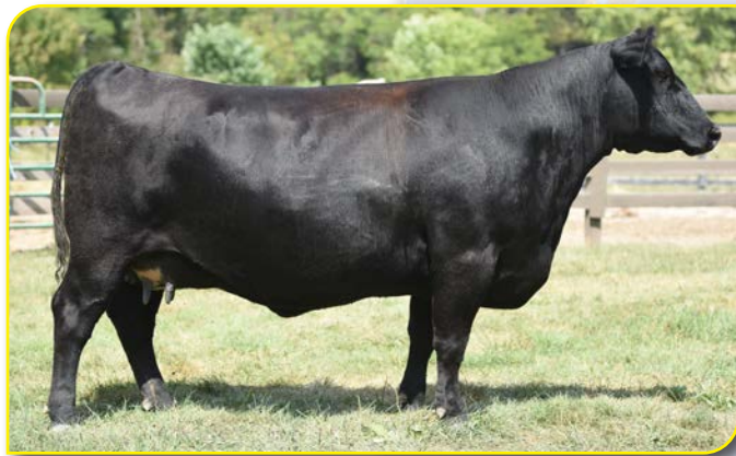
Blue Lake Blackcap 5119 - Lot 11

Owned by: TOLL ANGUS 6 PATHFINDERS A first calf heifer by the mighty BJ SURPASS. Sells with a 9-1-24 bull calf by TAF SADDLE UP 2031.