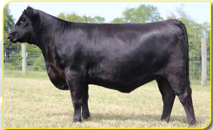
P W Butter Fly 316 - Lot 1

Owned by: WINDERL A fine replacement heifer from the well-known Butter Fly lineage. She is loaded with extra capacity and should make a really nice matron and front pasture cow for someone. Has great calving ease numbers and spread of balance with a stacked pedigree for great things in my opinion. Sired by BALDRIDGE HERDSMAN and has an Angus G S test in process. Sells OPEN.