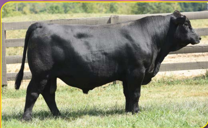
Heritage 216 Growth Fund 342 - Lot 31