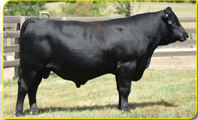
Heritage Surpass 352 - Lot 32