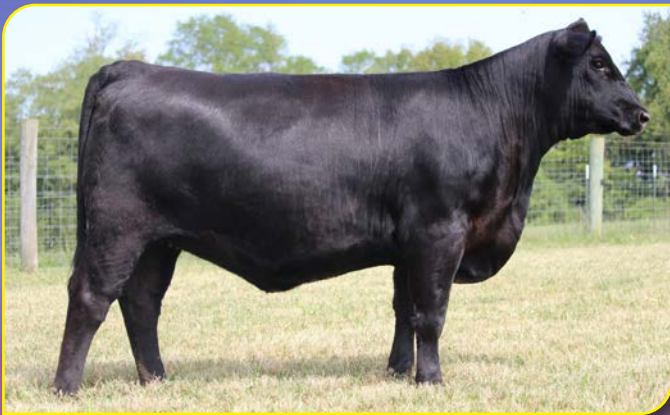
LCF BLACKCAP R325 - Lot 3

PRSRT FIRST-CLASS U.S. POSTAGE PAID St. Joseph, MO Permit #2017