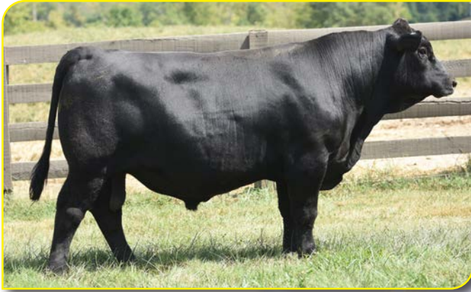
Heritage 216 Growth Fund 342 - Lot 31